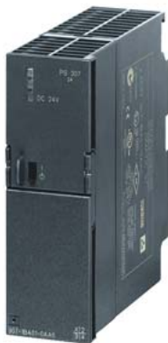
SIMATIC PS307/1AC/24VDC/2A SIMATIC S7-300 Regulated power supply PS307 input: 120/230 V AC, output: 24 V DC/2 A